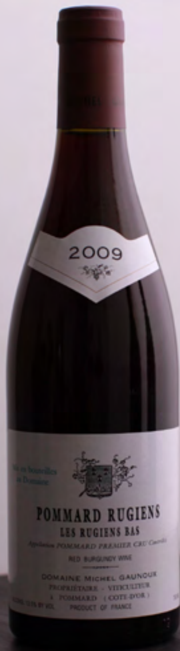
133 2009 POMMARD LES RUGIENS