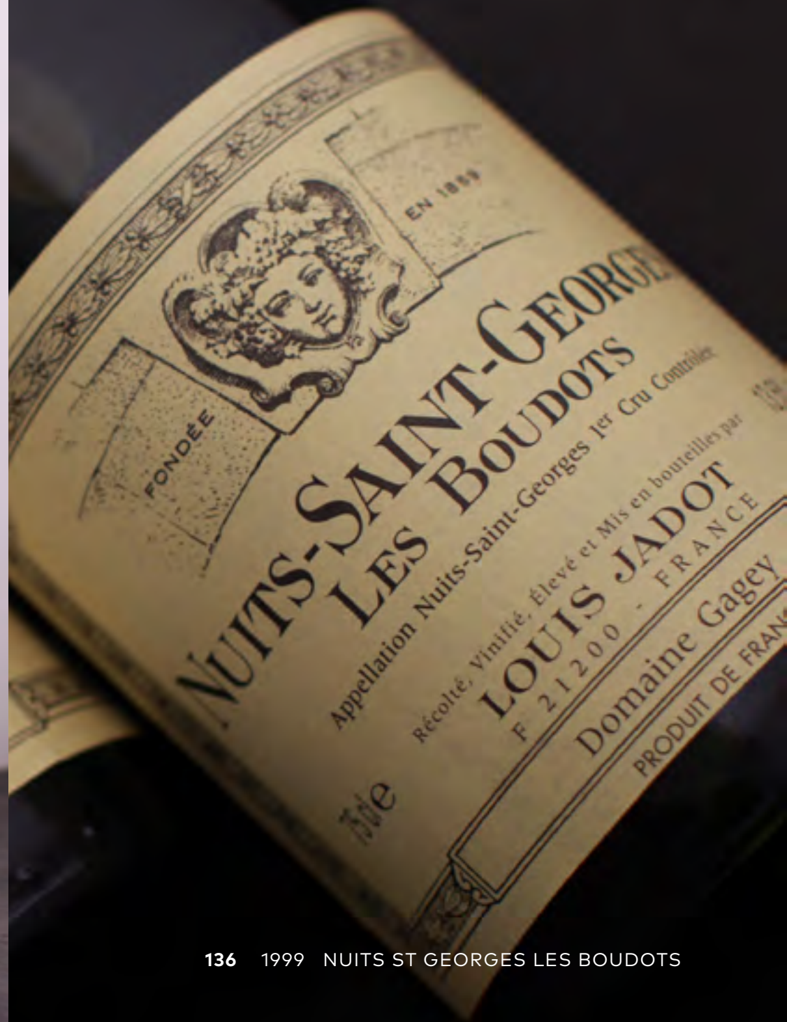
136 1999 NUITS ST GEORGES LES BOUDOTS