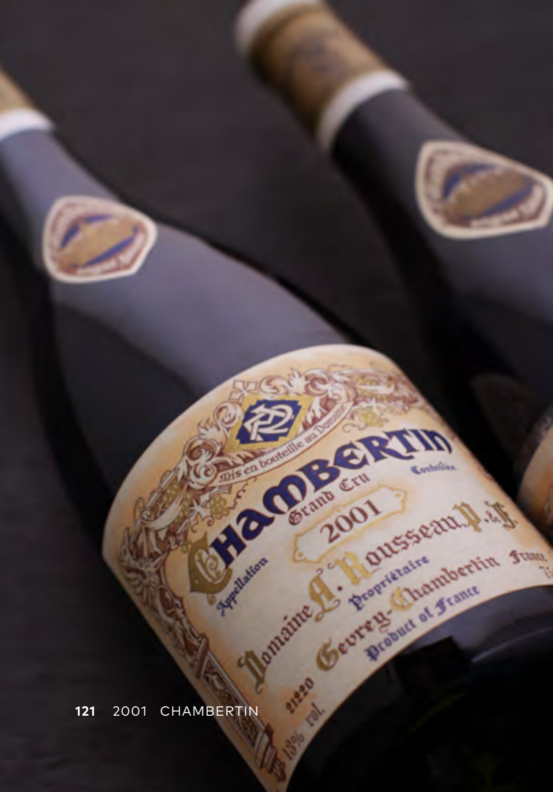
121 2001 CHAMBERTIN