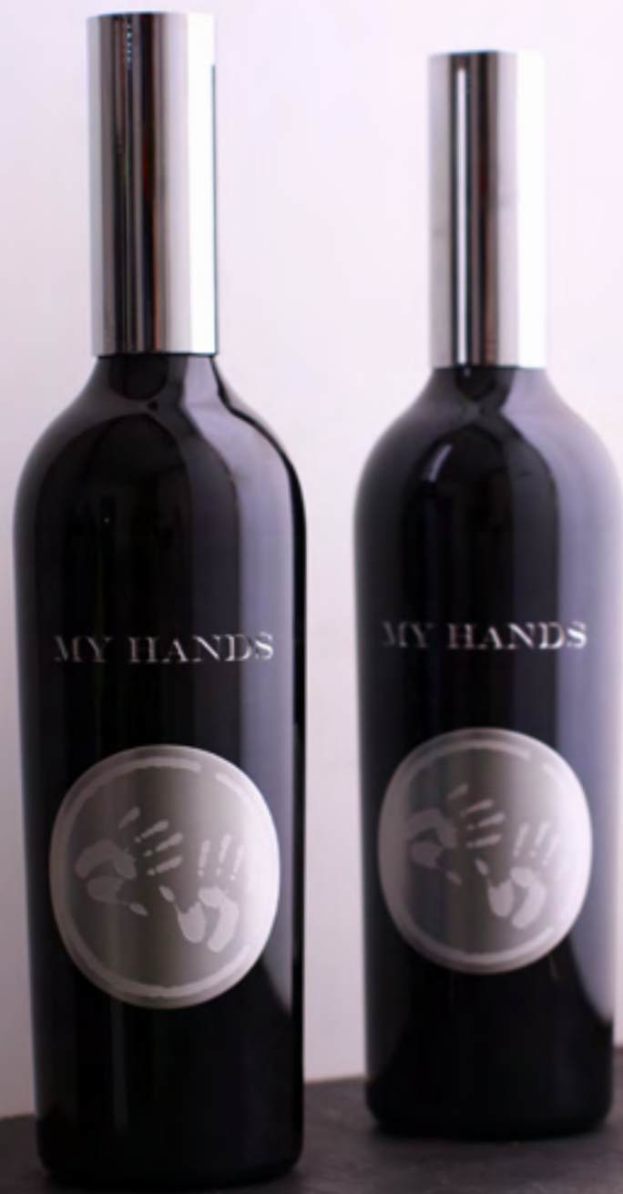
31 2005 MY HANDS SHIRAZ