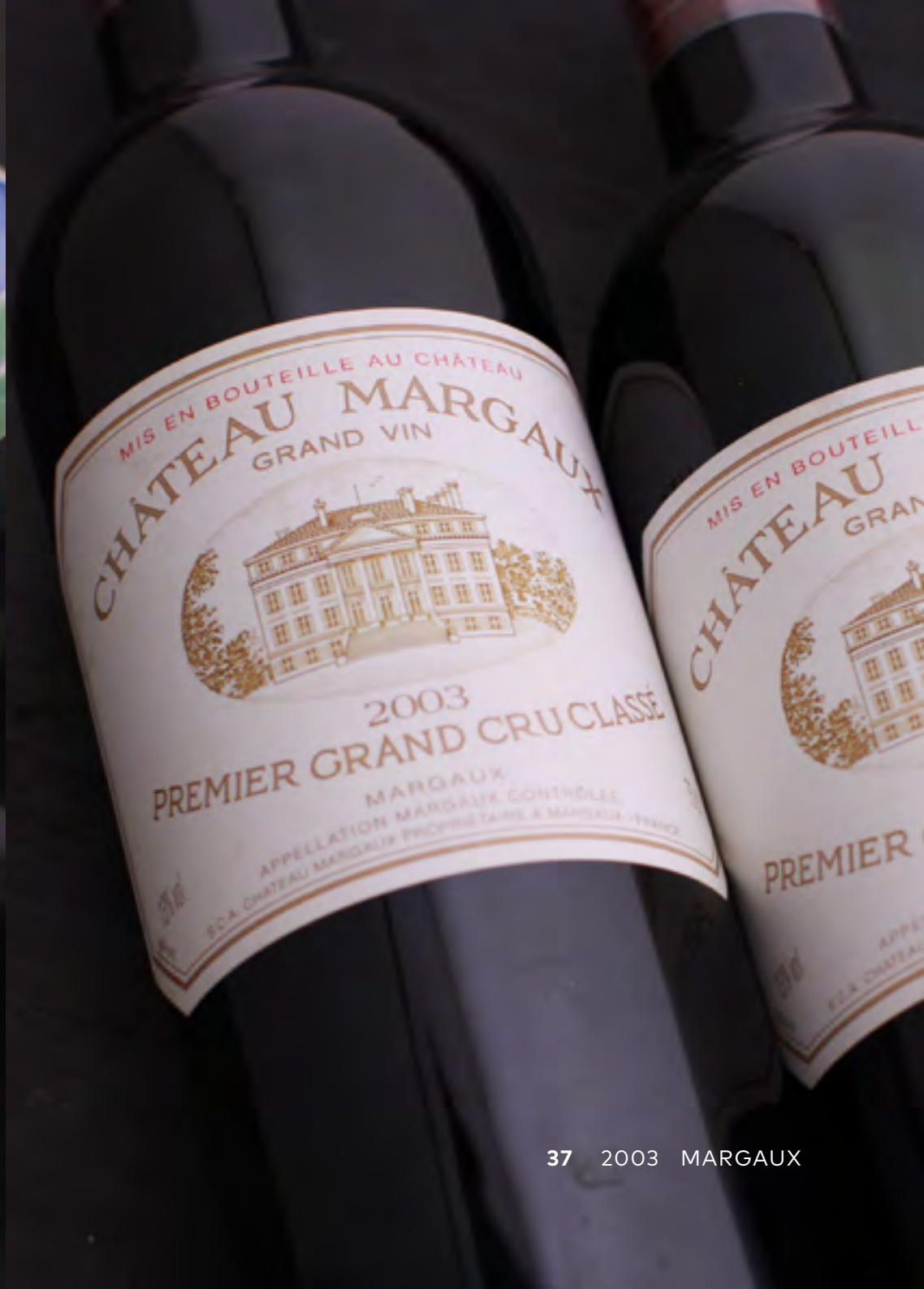
37 2003 MARGAUX