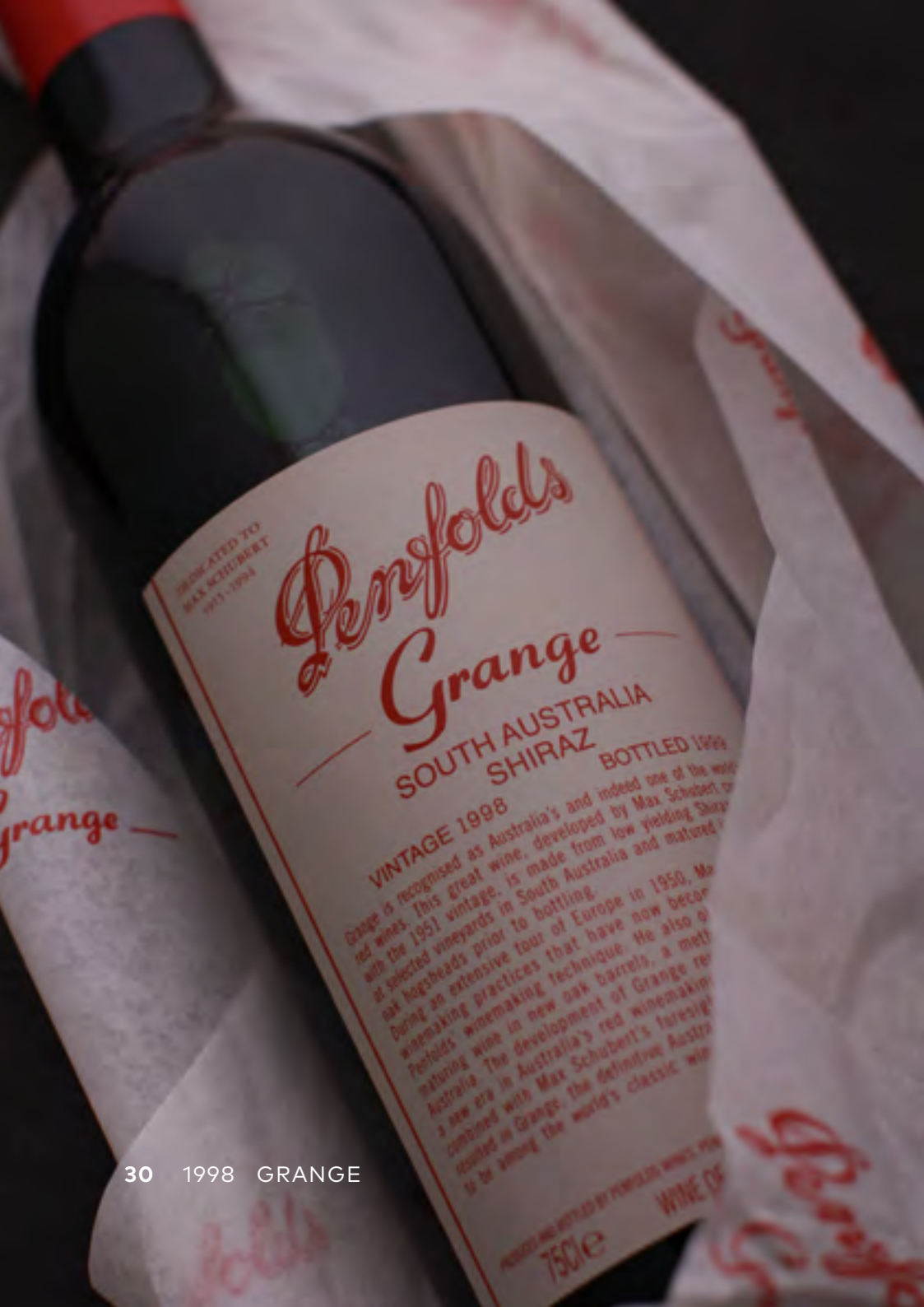
30 1998 GRANGE