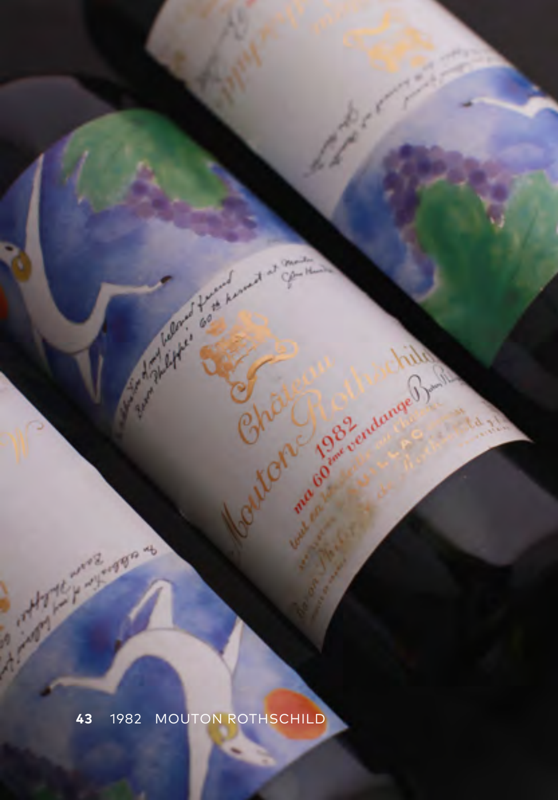
43 1982 MOUTON ROTHSCHILD