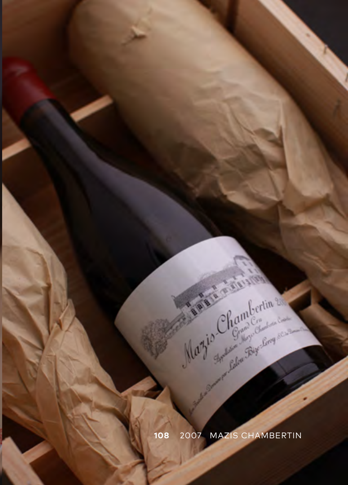
108 2007 MAZIS CHAMBERTIN