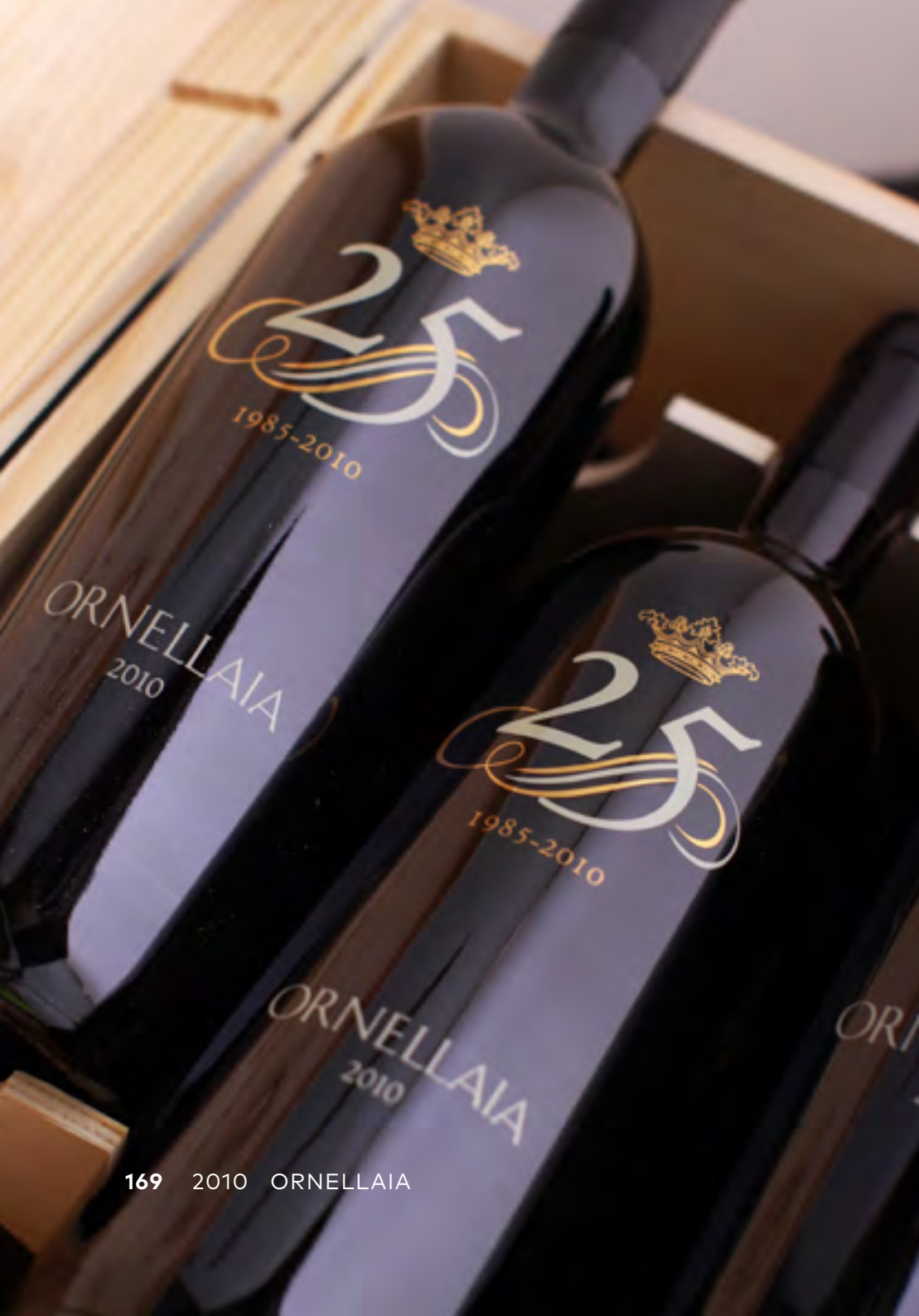
169 2010 ORNELLAIA