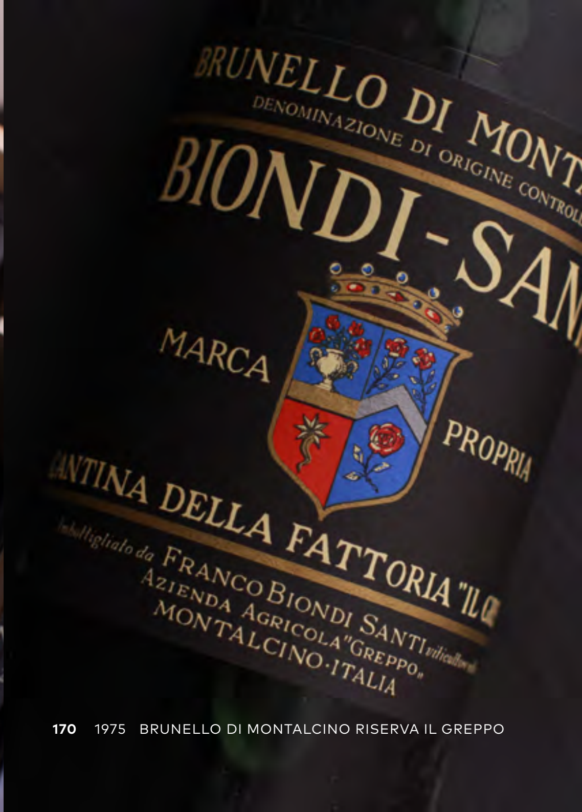
170 1975 BRUNELLO DI MONTALCINO RISERVA IL GREPPO