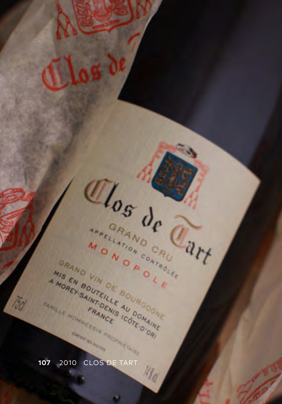
107 2010 CLOS DE TART